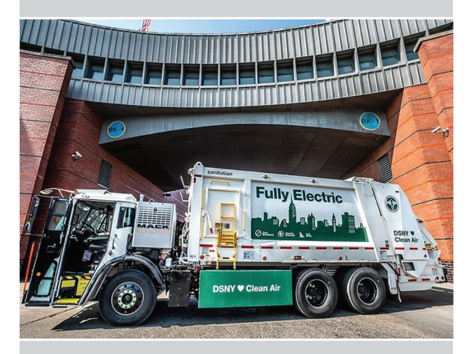
A Mack LR Electric garbage truck operated by the New York City Department of Sanitation.

With deep experience managing complex revenue streams, the CFO will build the organization's finances of the future through forward-looking expertise formed by experience from the leading