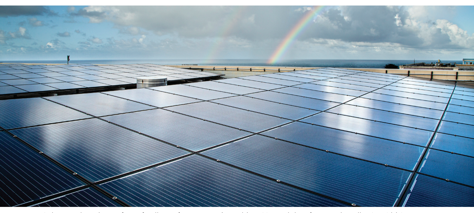
Solar panels at the rooftop of Ballajá Infantry Barracks Building (Cuartel de Infantería de Ballajá) in Old San Juan, San Juan, P.R., on March 26, 2021.