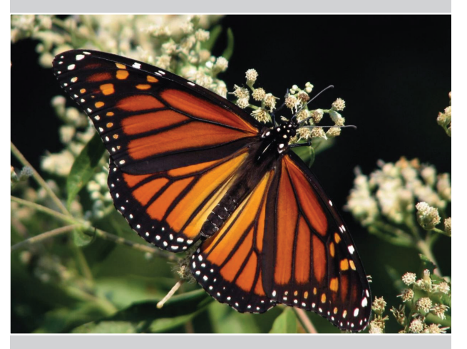
In a migration that takes at least four generations to complete, monarch butterflies make their way 2,500 miles across North America from Mexico to Canada.

The CFO will create and model continuous learning and improvement and foster a culture of excellence, innovation, and responsiveness.