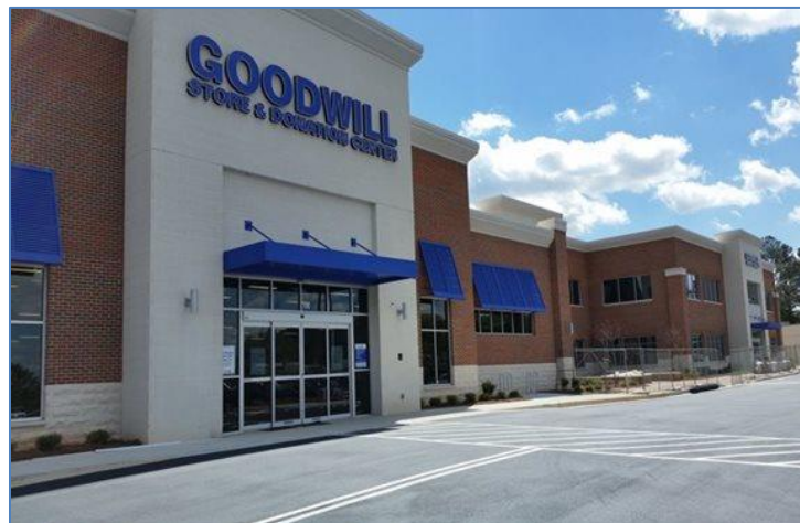
Goodwill's retail/donation center, career center and corporate support center (distant right) in Decatur

Consistent with GNG's penchant for repurposed goods, the former shopping center now houses a technologically current, employee-friendly complex that houses a retail center for donations and shoppers, a Career Center and Goodwill's administrative offices under one roof.